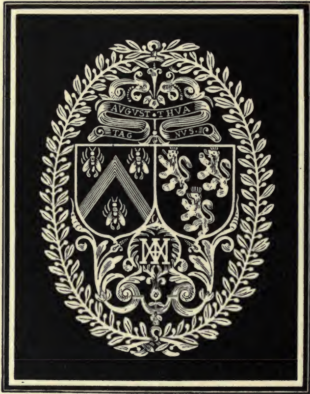
DE THOU AND GASPARDE DE LA CHASTRE.